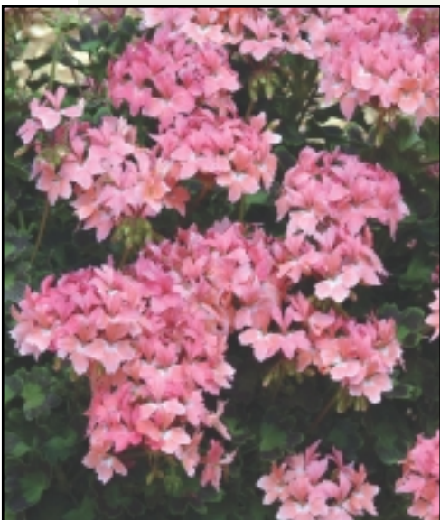
Pelargonium 'Fireworks Collection™'