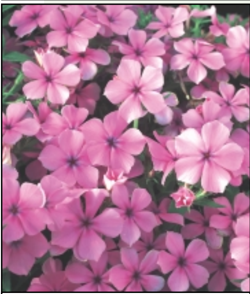
Phlox 'Intensia™ Lilac Rose'

N ext spring gardeners will be saying, "I saw it in Country Living Gardener ." An exciting new program has been created by the editors of Country Living Gardener called "Editor's Choice." This program features just six plants, and all of them are Proven Winners varieties.