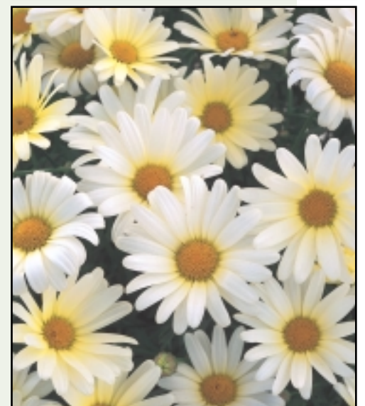
Argyranthemum 'Vanilla Butterfly'