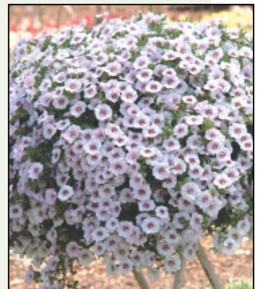
Calibrachoa 'Superbells™ Pink Kiss'