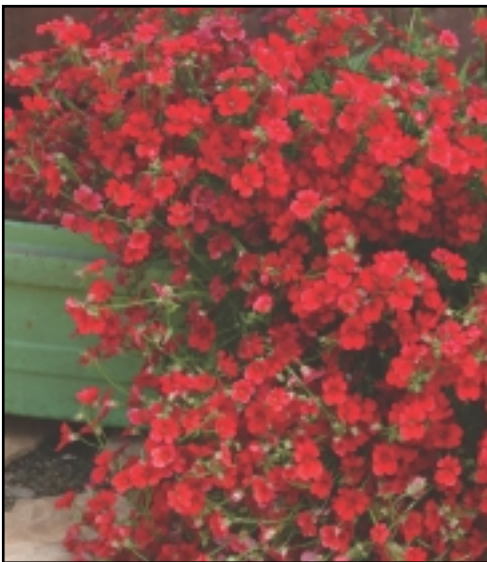
Nemesia 'Sunsatia™ Cranberry'

Proven Winners® PW A Better Garden Starts With A Better Plant.®